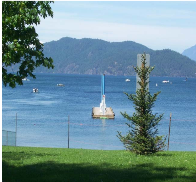
Looking north at Marine Sani-station from Rendall Park

The service is provided at no cost and is very quick and easy with self explanatory instructions. The station is a remote pumping centre situated on a separate dock adjacent to the boat launch ramp.