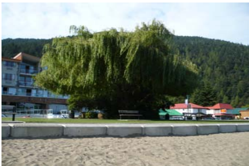
Popular Locations for Wedding Ceremonies!!