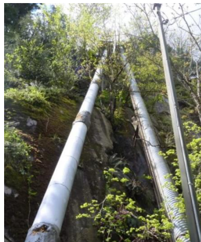
Water Supply & Return Lines