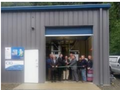
Water Treatment Plant Upgraded in 2014

Currently, this infrastructure is vulnerable to natural disasters. These lines are currently above ground and do not meet seismic standards which makes them vulnerable to damage in the event of a large earthquake.