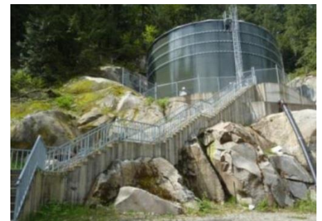
Water Storage Reservoir Upgraded in 2013