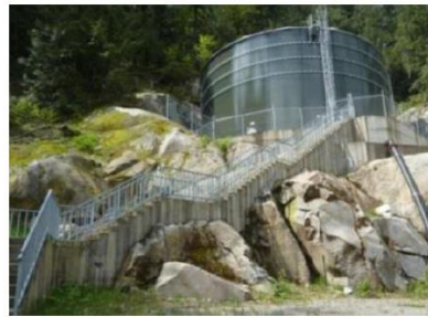
Water Storage Reservoir