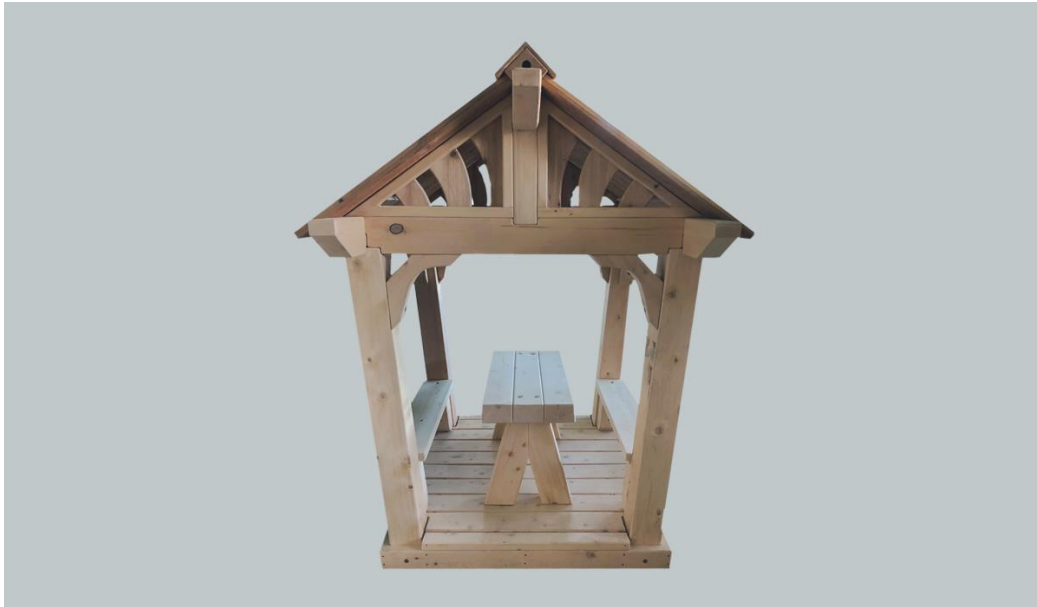
Wooden Playhouse with Benches and Table – Estimated Cost $7,500.00

Proposed costs of some options that would facilitate natural play are shown below. As there is no funding available at this time, these are identified as ideas for discussion and could be worked into future budgets or grant applications when opportunities arise.